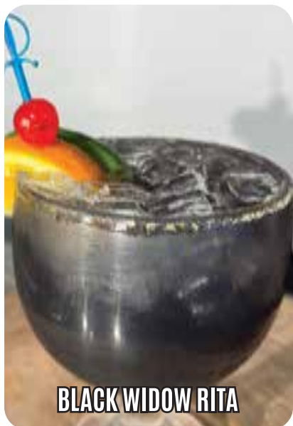
BLACK WIDOW RITA