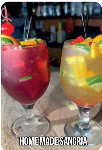
HOME MADE SANGRIA