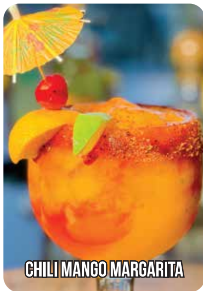
CHILI MANGO MARGARITA