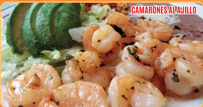
CAMARONES AL AJILLO