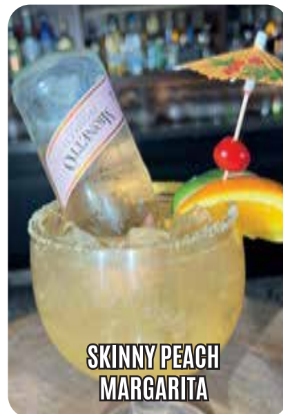
SKINNY PEACH MARGARITA