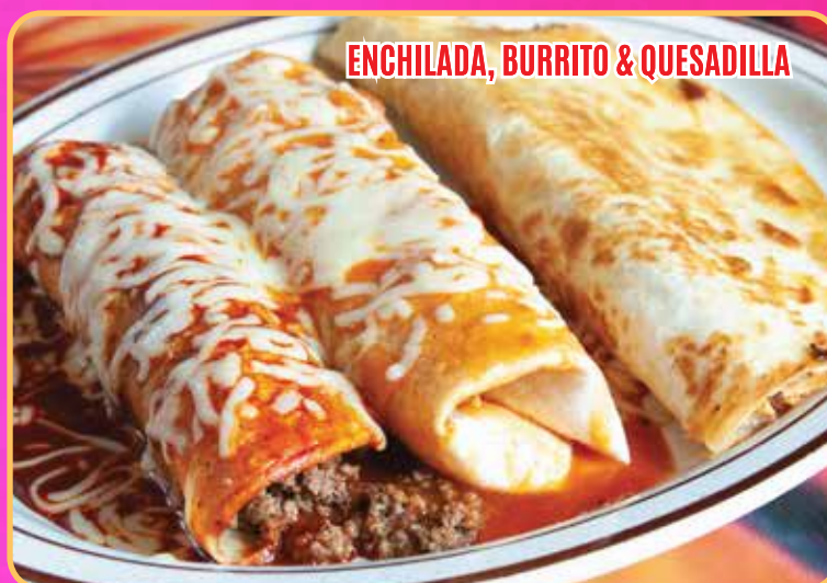
ENCHILADA, BURRITO & QUESADILLA