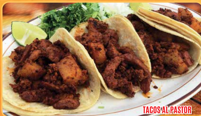
TACOS AL PASTOR